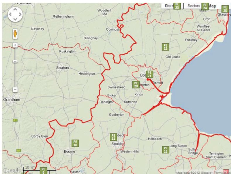
Contains Royal Mail data © Royal Mail copyright and database right 2012. Contains Ordnance Survey and National Statistics data © Crown copyright and database right 2012

To articulate and manage the admission process the Lincoln UTC will fully integrate into the Admission Arrangements centrally managed and coordinated by the Local Authority. Being located in Lincolnshire the UTC will embrace the Admissions Arrangements of Lincolnshire County Council who will then liaise with other Local Authorities.